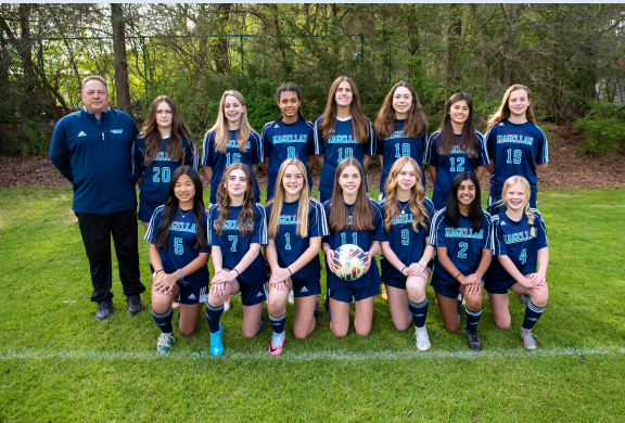
GIRLS SOCCER - BLUE TEAM