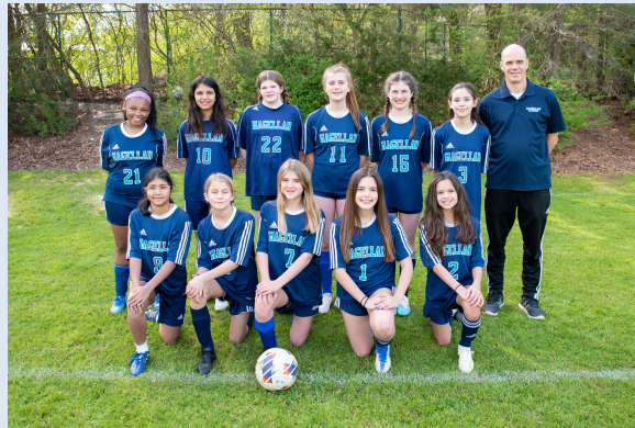
GIRLS SOCCER - TEAL TEAM